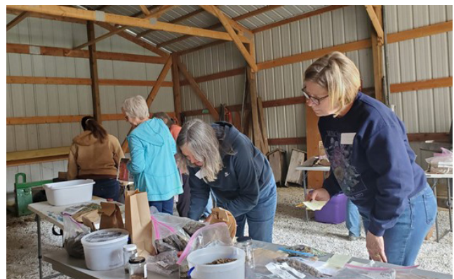
Participants at the Native Seed Share explore the numerous seeds available. Everyone received their top three species choices, as well as other quality seed.