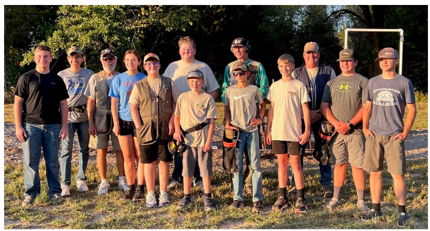
Exhibit a poster or stand-alone display depicting safe firearm handling, range safety, the parts of the rifle/shotgun/pistol, tracking the target, target sighting, or another topic you have learned through the 4-H Shooting Sports program.

SF 50380Shooting Sports: Archery Display SF 50381Shooting Sports: Rifle Display SF 50382 Shooting Sports: Shotgun Display SF 50384 Shooting Sports: Pistol Display