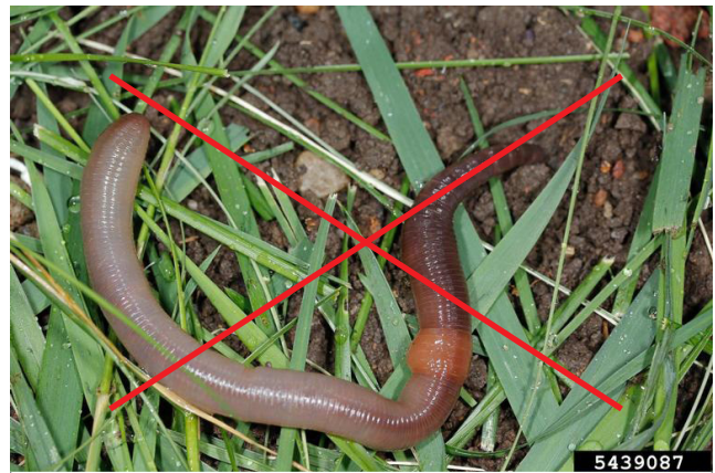
Fig. 3. Common earthworms, ( Lumbricus terrestris ) are a red-brown color with a raised clitellum.