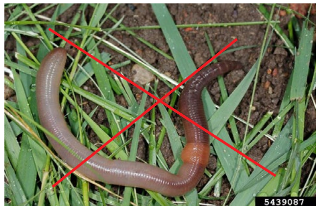
Fig. 3. Common earthworms, ( Lumbricus terrestris ) are a red-brown color with a raised clitellum.