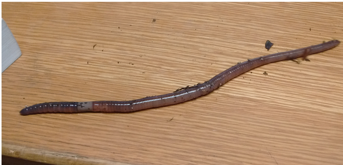
Fig. 1. An adult jumping worm that was submitted to a University of Illinois Extension office for identification.