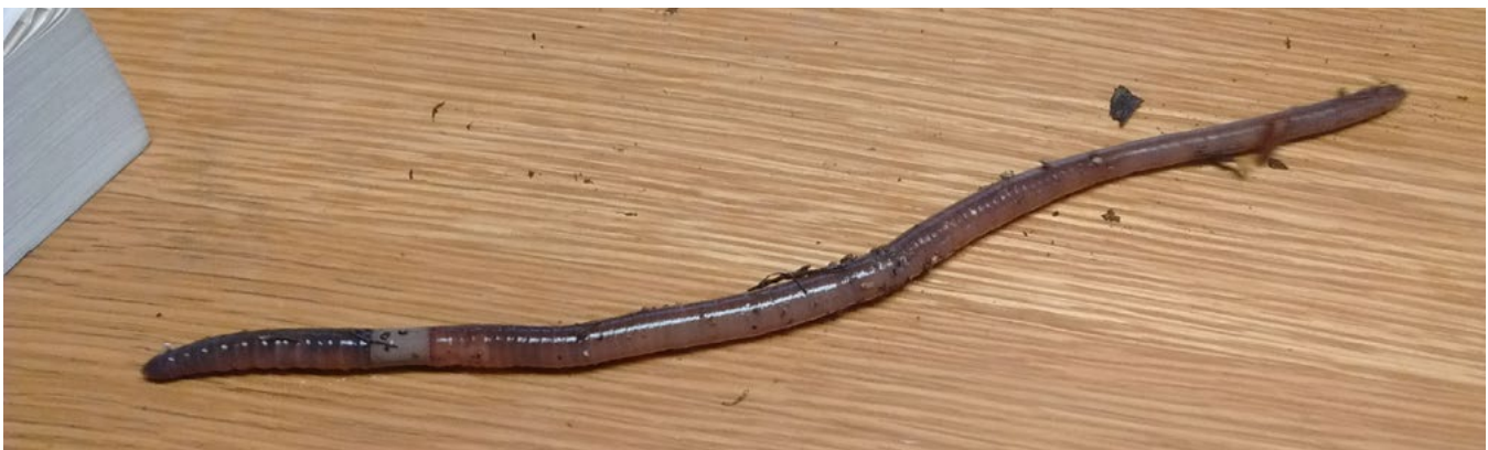
Fig. 1. An adult jumping worm that was submitted to a University of Illinois Extension office for identification.