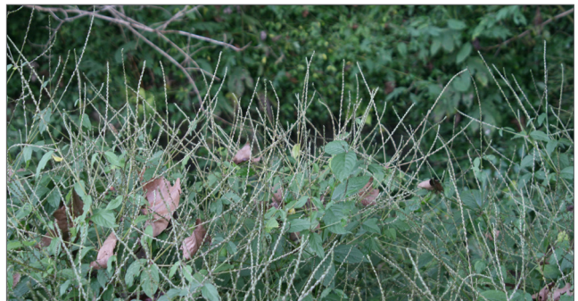
Fig. 7. Seeds of chaff flower develop on long spikes that persist through the winter as a tan hatch.