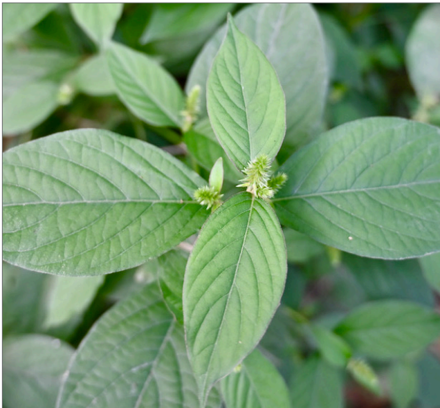
Fig. 4. Chaff flower has opposite leaves with smooth margins and prominent venation.

This species is also an exotic invasive. The vegetative parts look very similar to chaff flower. Key distinguishing features: Flowers tend to have more purple or red color compared to chaff flower and there are feathery protrusions in between the stamens of the flowers (called Pseudostaminodes). These protrusions are smooth in chaff flower. To date, Devil's horsewhip is only known to occur south of the invasive range of chaff flower.