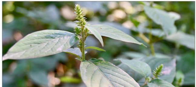
Fig. 1. Chaff flower can form a dense stand, crowding out other plant species.