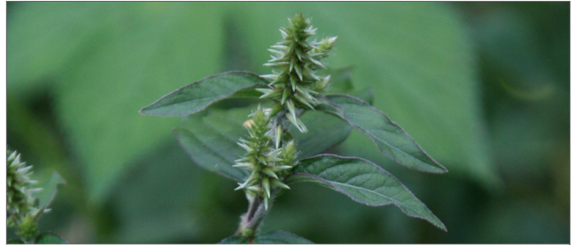
Fig. 6. Flowers are green and arranged in a bottlebrush-type spike that elongates as seeds develop.