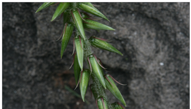
Fig. 8. Stiff bracts at the base of seeds allows them to stick to fur and clothing, making it easy to accidentally transport chaff flower.