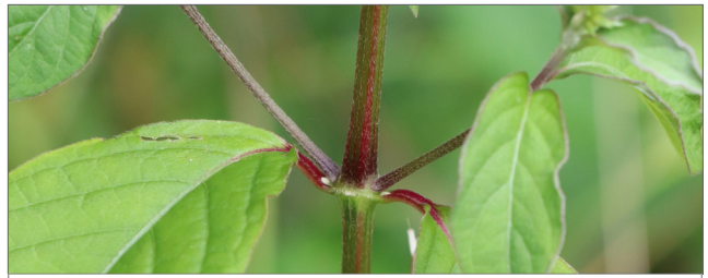
Fig. 5. Stems of chaff flower have a square shape and can have a red color, particularly at nodes.