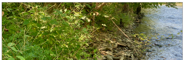
Fig. 3. Chaff flower's initial spread typically follows along riverbanks but it can also spread into upland habitats.