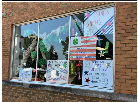
From top: Pleasant Spacemakers, Busy Bees, Jolly Workers