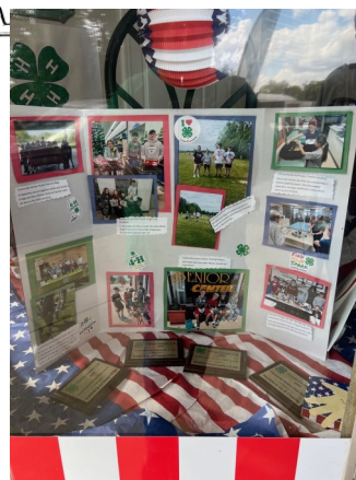
Below l to r: Smithfield Up & Coming, Fairview Huskies.