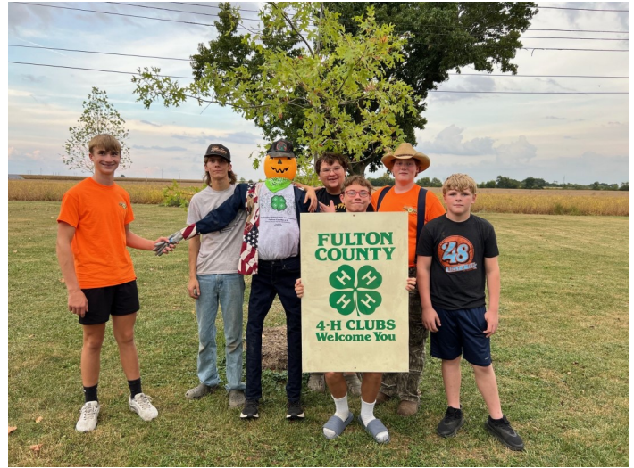
Above: Fulton County 4-H Federation members with their entry to Lewistown's Scarecrow Contest, "George Green."

Watch for more information regarding a winter county-wide event for members and their families. Federation is open to all 4-H members aged 13-18 of the current 4-H year.