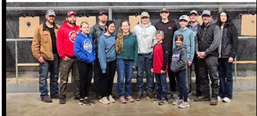
4H .22 Pistol