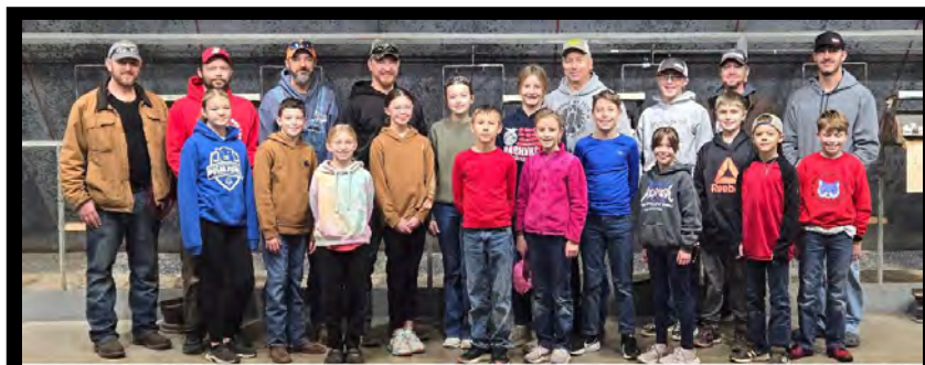
4H Air Rifle

The Staunton Road Rangers Shooting Sports 4-H Club has been holding its winter practices at the Highland Pistol and Rifle Club. Thank you to the Highland Pistol and Rifle Club for allowing our 4-H Club to use your facilities!