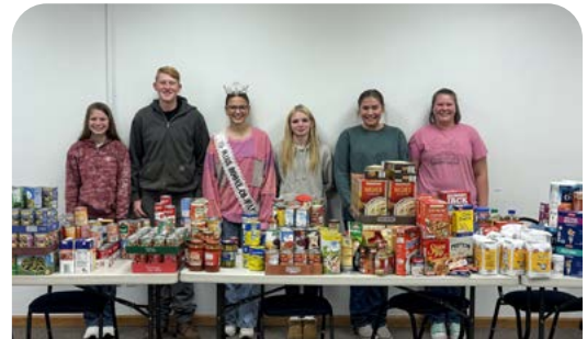
Boone County 4-H members participate in the Fall Food Shower service project.

Boone County 4-H members participated in two meaningful service projects: Military Mail and the Fall Food Shower. This year, youth created and sent 1,145 cards to soldiers overseas, with 14 members decorating 25 or more. The Fall Food Shower brought clubs together to donate pantry staples and toiletries. In total, they contributed 826 food items and $100. Across DeKalb and Ogle counties, 4-H members also took part in several service projects. Youth planted oak trees through the Oak Tree Savannah Program, made cards for Opportunity House, and prepared a meal for Hope Haven. Ogle County members placed third in the Illinois 4-H Can Food Drive and organized cereal and food drives for local pantries. These efforts highlight the generosity and leadership of 4-H youth.