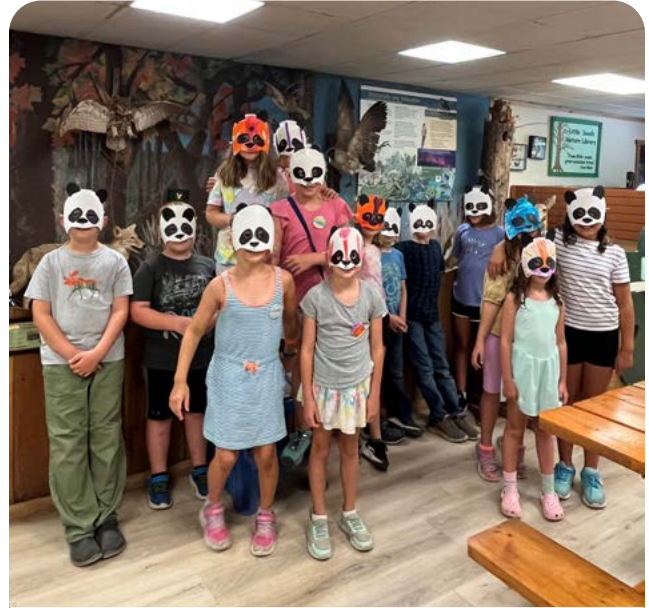
Campers show off their creativity with handmade panda masks during the Endangered Species Camp.