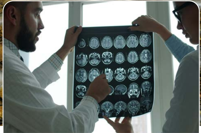
Illinois Extension partnered with the Southern Illinois University School of Medicine in Springfield to expand access for caregivers to the 2025 Brain Aging Conference.