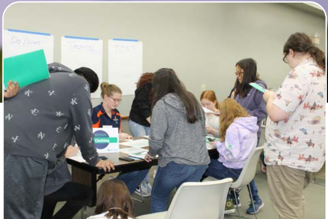
High school students participate in the two-hour "Welcome to the Real World" financial literacy simulation.

Learn more about the Community and Economic Development programs extension.illinois.edu/bdo/community-and-government