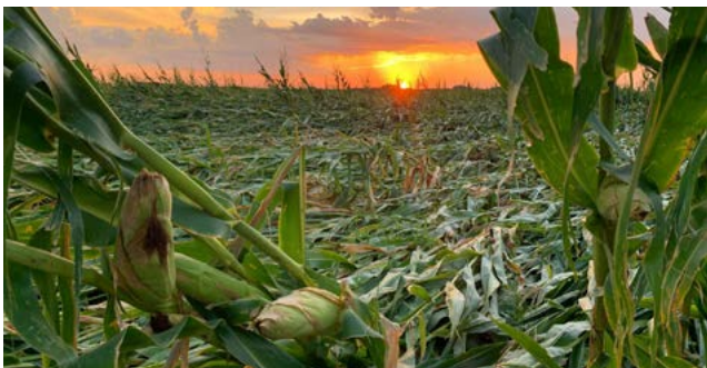
Fig. 3. Wind damage to corn.