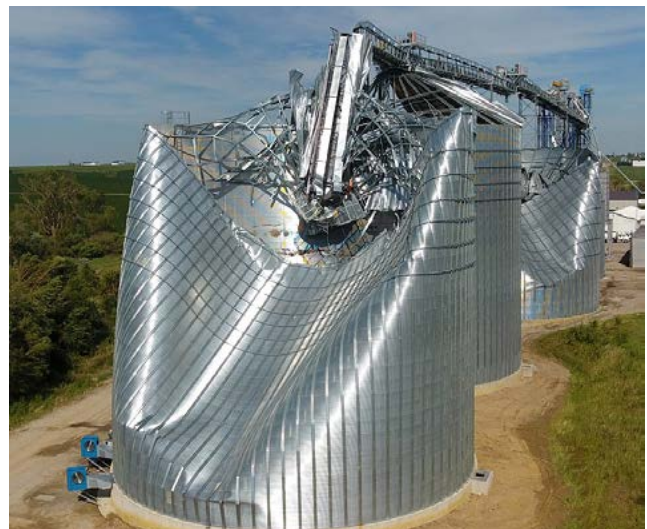
Fig. 4. Derecho damage to grain bins.