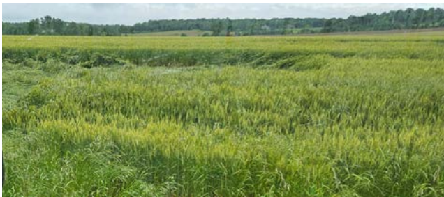
Fig. 2. Wind damage to wheat.

High winds and derechos have historically been most likely to occur in northern Illinois (among the highest frequencies in the world), but still are possible in central and southern portions of the state. Most derechos occur in the summer, between June and August. It is not yet known whether high winds and derechos are likely to become more common or more severe with changing climate conditions. However, derechos are a common part of Illinois' climate, and they will continue to occur in the future.