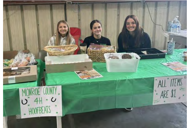
Thank you to the Monroe County Hoofbeats Club for selling baked goods and drinks at the Sheep Festival!