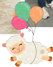
Thank you to the 4-H Federation for helping with set-up, sponsoring Kid's Corner, and assisting with dining!