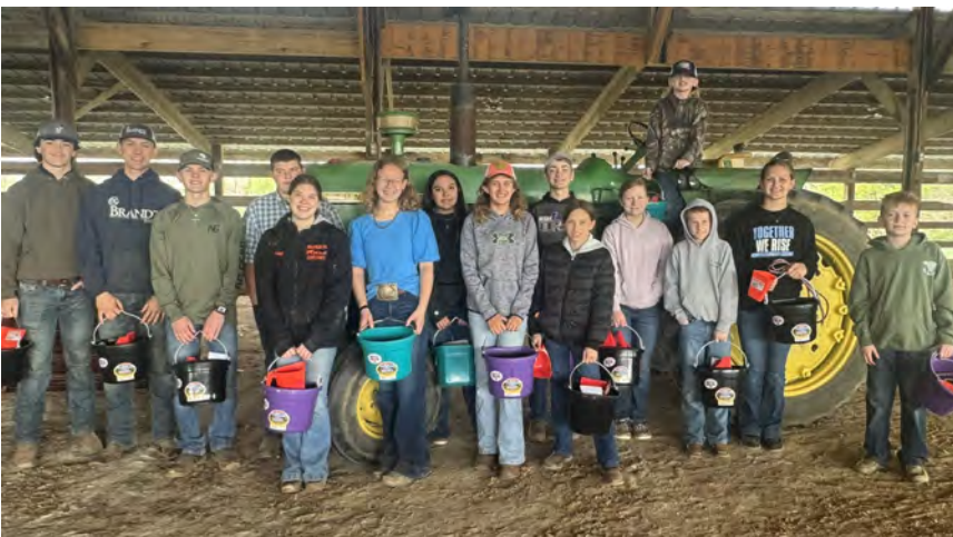
*Winners and participants also received prizes from Ketcham's Sheep Equipment.