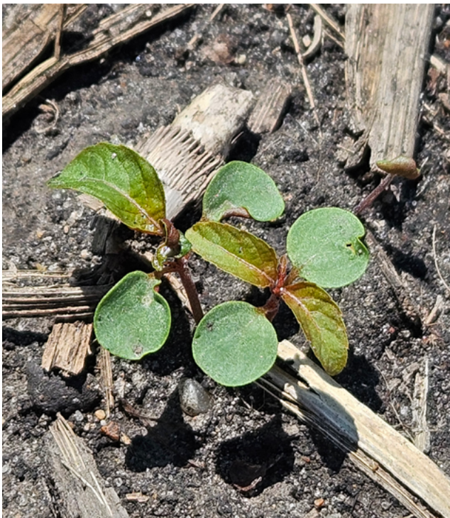
Asian copperleaf seedlings often germinate in dense clusters underneath the crop canopy.