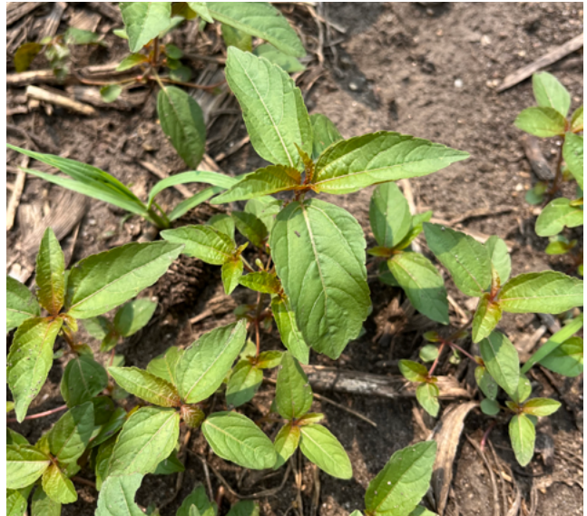
Vegetative plants can be difficult to distinguish from Asian copperleaf's relatives.

Asian copperleaf is an annual, herbaceous plant that reproduces only by seed. It forms dense monocultures, survives in partial shade, and is often discovered at harvest between crop rows. Reports from its native range note several herbicide resistances in populations. Researchers, agronomists, and farmers are concerned due to Asian copperleaf's rapid spread by unknown means, its persistence in crop fields, and possible future herbicide resistance development.