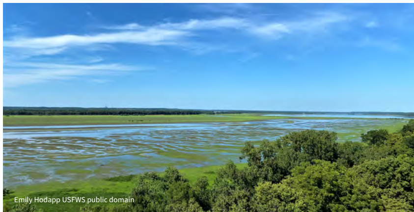
Emily Hodapp USFWS public domain