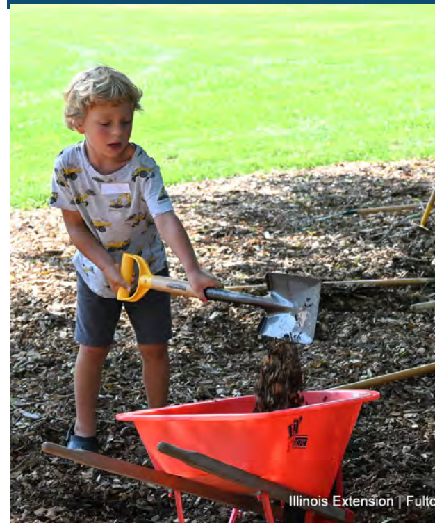
Illinois Extension | Fulton

Mindfulness Hikes Outdoor Yoga Nature Journaling