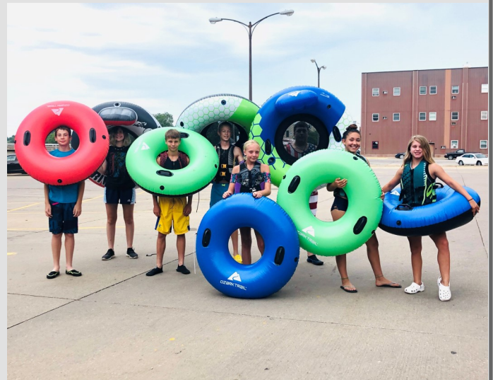
Federation members attended a tubing trip to celebrate the end of a great year!

Federation members spent time decorating flamingos for our County 4-H Flocking... to celebrate National 4-H Week.