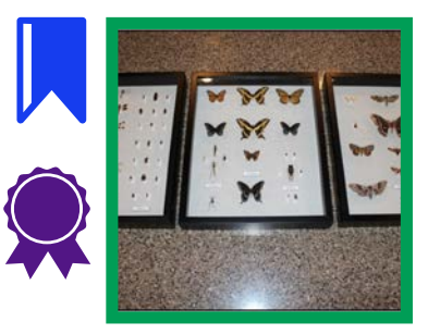
Blaine Weigelt, 10 Metamora Blue Ribbons Entomology 2 Award of Excellence Champion