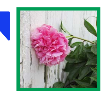
Audrey Blunier, 12 Roanoke Happy Hustlers Photography 2: Close Up Award of Excellence