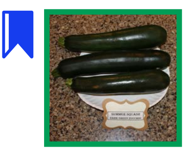
Cassandra Weigelt, 10 Metamora Blue Ribbons Vegetable Gardening: Vegetable Plate State Fair Delegate