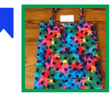
Amelia Hahn, 9 Clover Patch Kids STEAM Clothing 1: Sewn Non-Clothing Award of Excellenc e