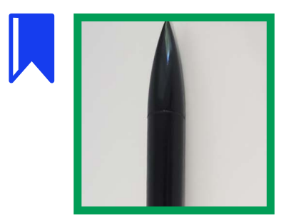
Elliot Grove, 8 Metamora Blue Ribbons Aerospace: Model Rocketry Award of Excellence