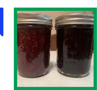
Benjamin Grove, 17 Metamora Blue Ribbons Food Preservation Award of Excellence