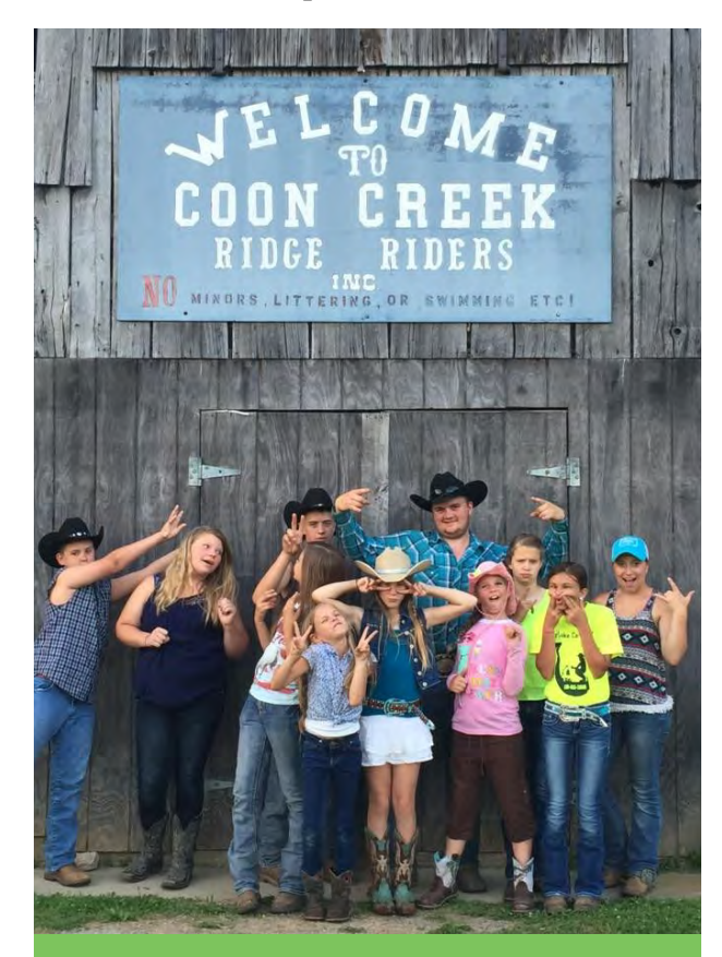
Horse Camp held in Edwards County

Many of these are seen, but many go unseen and we are proud of all that they do for the small community that we live in. In the 2015–2016 year our youth really loved the hands on workshops.