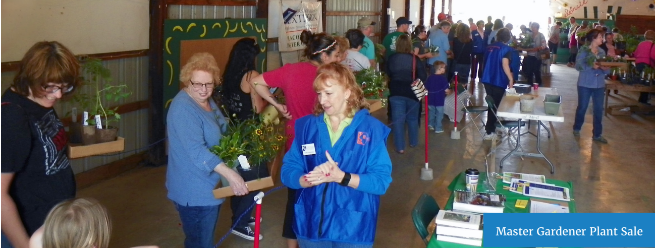
Master Gardener Plant Sale

The University of Illinois Extension horticulture program in DeWitt, Macon and Piatt counties helps thousands of people in Central Illinois every year by answering horticulture questions, organizing the Master Gardener program and leading classes such as the Bringing Back the Basics program on Small Space Gardening and Composting Year Round.