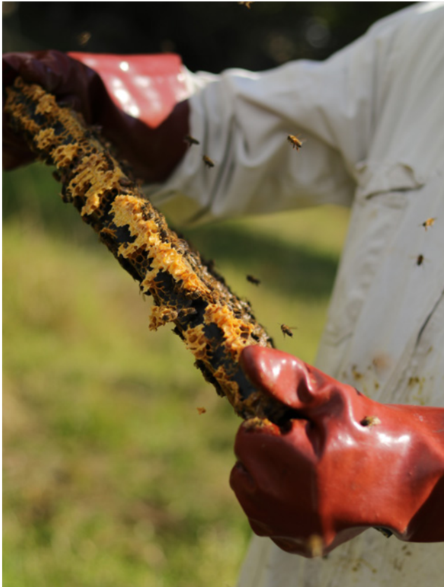
Live at the Bee Hive with Jeff Ludwig is an exciting look at the secret life of bees. Ludwig opens a hive while explaining how honey bees live.

One video, “Live at Hunter Haven Farm,” featuring Doug Block from Pearl City, follows a day at a dairy farm. Block takes viewers on an extensive tour of the milking facility where 900 cows are rotated through the milking process. Students get a close look at a newly born calf, one learning to stand, and cows eating their breakfast. They learn the ingredients of the food cows eat and the material they sleep on. Block wraps up the approximately 30-minute lesson talking about how the animals’ food is stored.