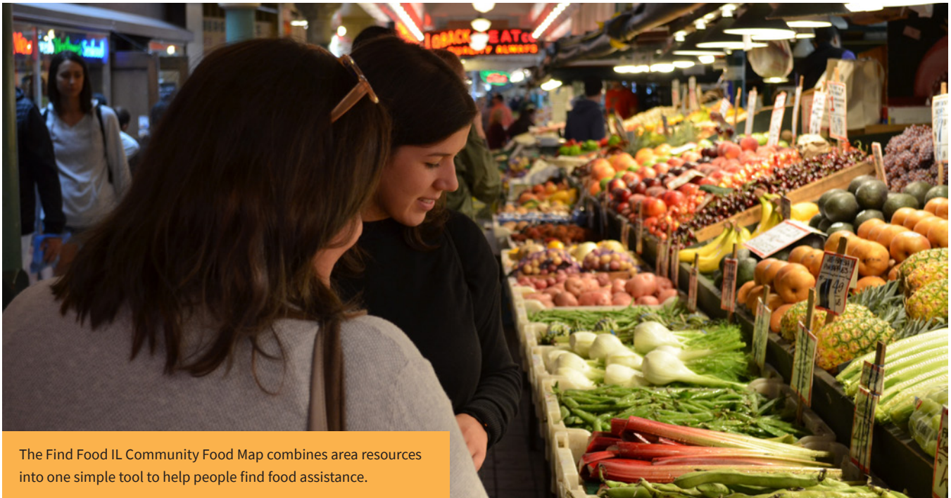
The Find Food IL Community Food Map combines area resources into one simple tool to help people find food assistance.