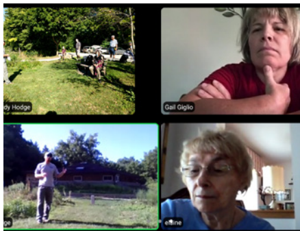
Virtual meetings kept Master Gardeners connected while learning.