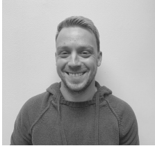
Billy Blue Personal Development