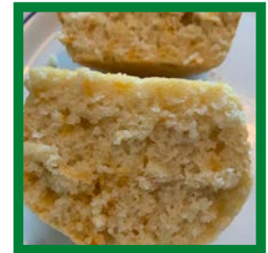
Bryce Rock, 9 Tractor Wheels Cooking 201: Cheese Muffins Award of Excellence