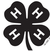
Federation 4-H Activities