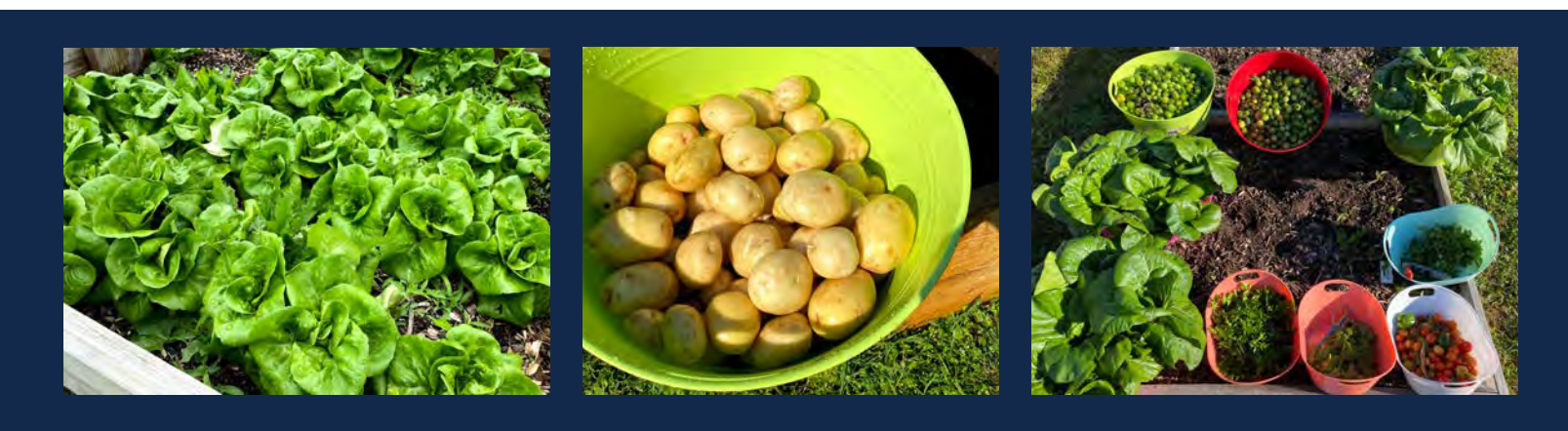
This institution is an equal opportunity provider. This material funded by USDA's Supplemental Nutrition Assistance Program - SNAP. College of Agricultural, Consumer and Environmental Sciences. University of Illinois | United States Department of Agriculture | Local Extension Councils Cooperating.

In 2018 we grew 70 lbs. In 2019 we grew 260 lbs. This year we grew 352.3, more than the previous two years combined!