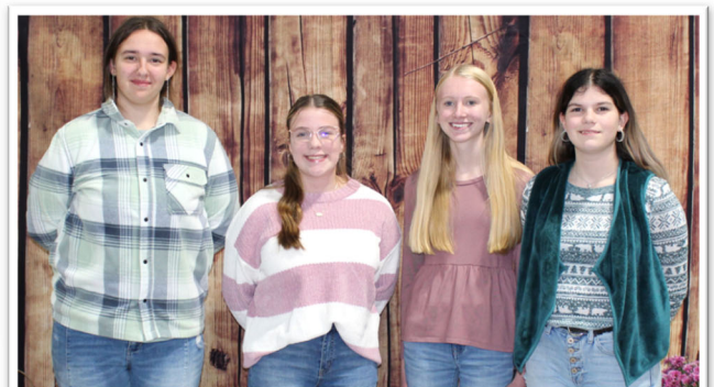
Federation Officer Team