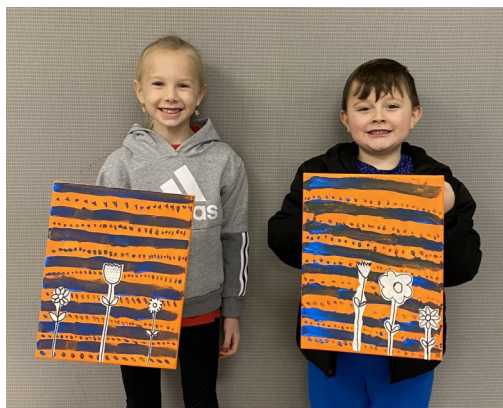
Cloverbud Canvas Workshop