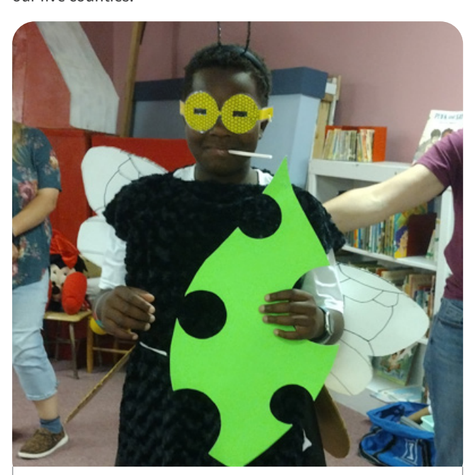
Youth participating in activities for Buzz about Bees program.

Building on the framework set up in 2022, we continued to offer family-based programming around nature-based learning for our five counties.