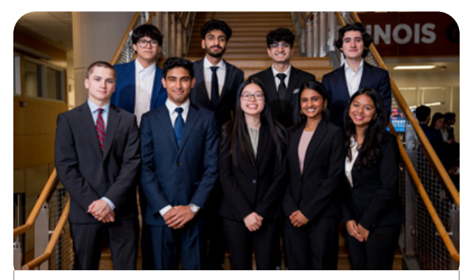
GIES College of Business team