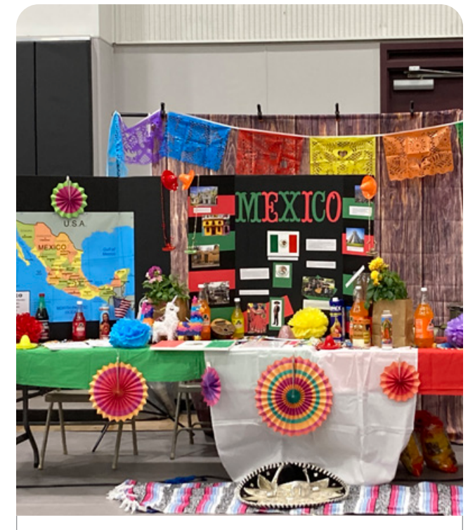
International display of Mexico

In bridging our traditional and school-based 4-H programs, Shawnee School District used the Passport to the World curriculum in their school clubs as a classroom project with an individual and small group exhibition opportunity. The school highlighted their classroom program champions and reserve champions with a field trip experience to see the International Night club displays; this trip is to encourage and engage 4-H school-based programs to participate in our events outside of the school day.