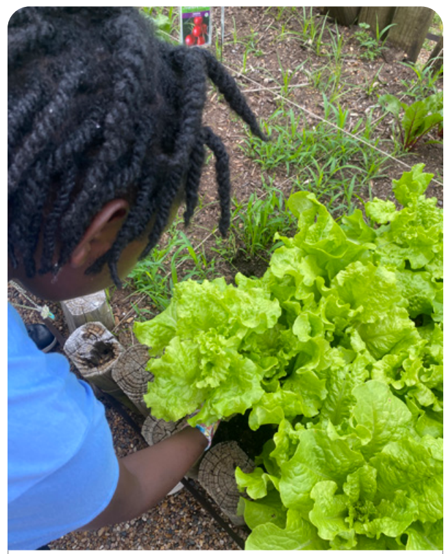
Youth harvesting from garden bed at Cairo Elementary School for Great Garden Detective.

Through adult nutrition education programs like Healthy Cents, participants are provided resources on how to save money at the grocery store, create healthier meals, and increase their physical activity. During the programs, community outreach workers use recipes provided by the curriculum and the "Eat. Move. Save." website for demonstrations highlighting a better cooking experience. The adults and meal sites have started incorporating these recipes into their weekly meal plans.