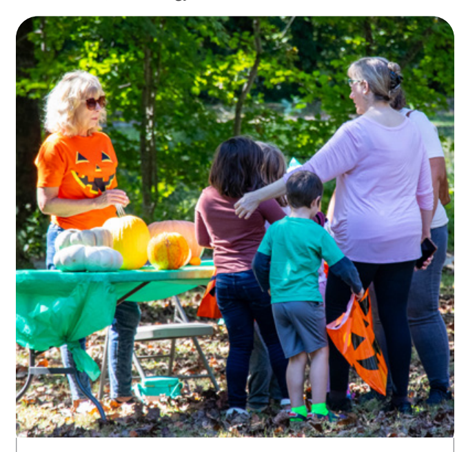
Youth learning about pumpkins from a volunteer.

Offered for the third year, Pumpkin Extravaganza attracted 150 participants who learned about pumpkins through educational stations, games, and crafts. This youth pumpkin event is a collaborative effort between SNAP Education, Master Gardeners, Master Naturalists, 4-H, and the Natural Resource, Environment, and Energy team.