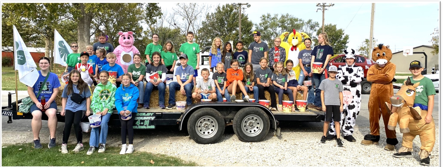
Scarecrow Daze Parade