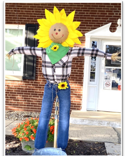
Oconee Eager Beavers Fan Favorite