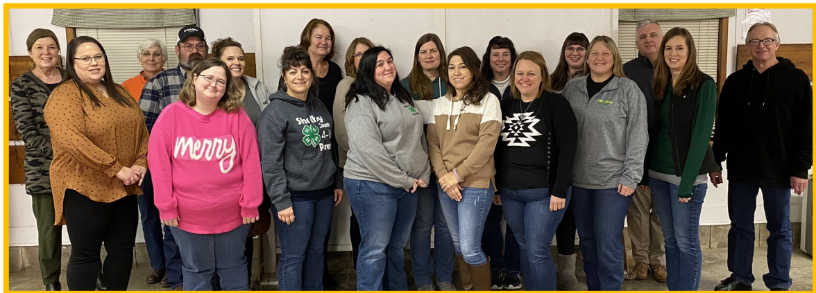
2023-2024 Leaders Appreciation Dinner