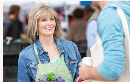
Shop unique items from a variety of garden vendors.