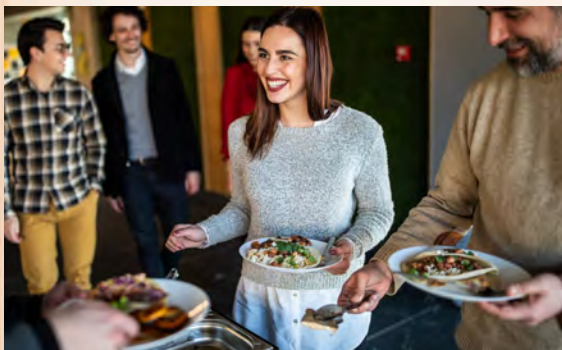
Morning coffee and rolls and a taco bar lunch are included.