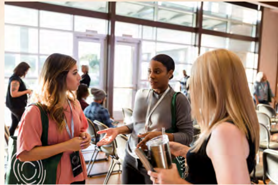
Network with fellow gardeners over lunch and between sessions.