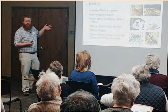
Connect with experts and grow in your gardening knowledge!