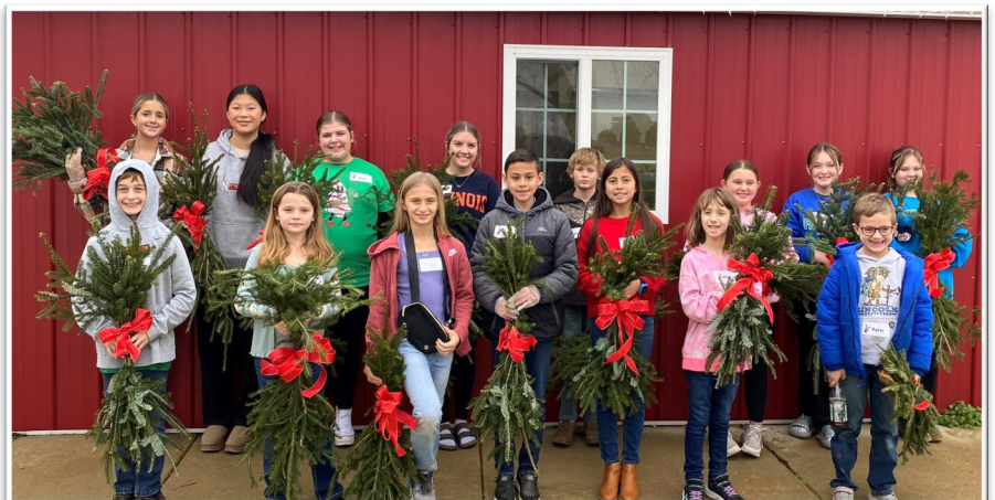
Swag Workshop at The Green Works