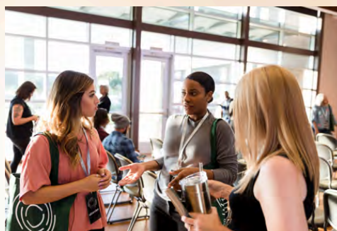
Network with fellow gardeners over lunch and between sessions.