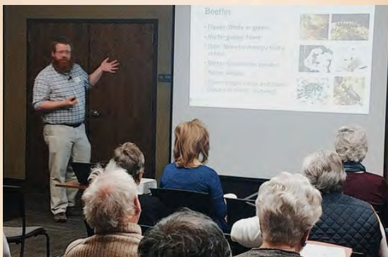
Connect with experts and grow in your gardening knowledge!