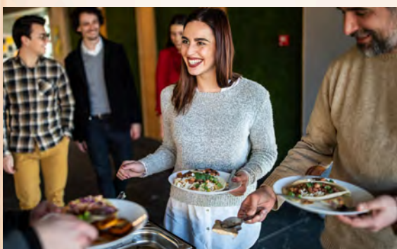
Morning coffee and rolls and a taco bar lunch are included.