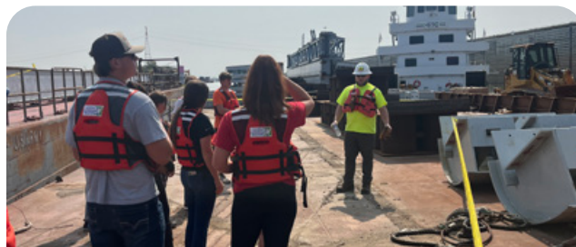
Natural Resource Management students listen to a speaker from the Living Lands and Waters Institute discuss careers related to rivers and natural resources.

The partnership between JWCC, University of Illinois, Illinois Extension, and the Orr Research Center Corporation continues to thrive, helping to train the next generation of conservationists with the knowledge and skills to make a significant, well-rounded impact on their communities and the environment.