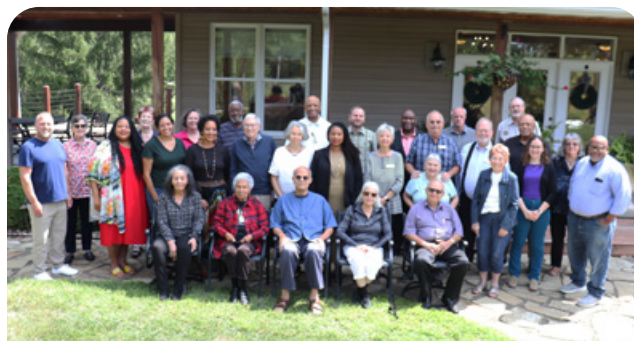
Stakeholders participate in a planning retreat covering specific aspects of the new National Historic Site and its transition.