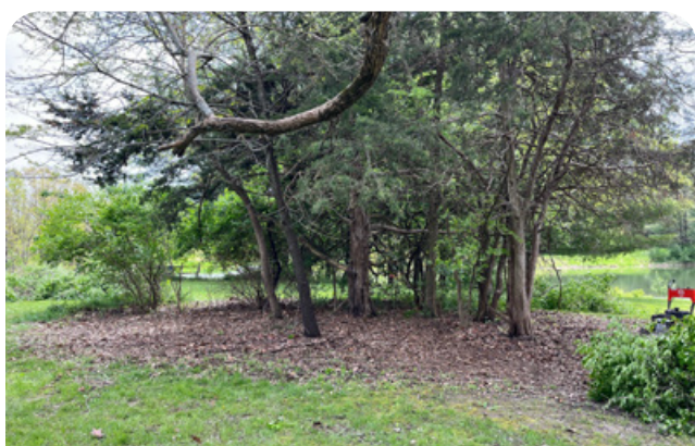
Habitat Help Team Example Work: Camp Eastman - After