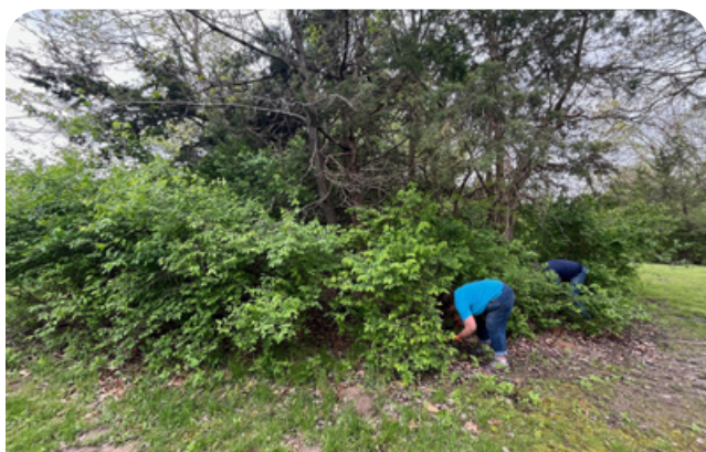
Habitat Help Team Example Work: Camp Eastman - Before

The Habitat Help Team performed regular volunteer activities at natural sites, including invasive plant removal, trail clearing, and educational material development. Thanks to their efforts, visitors can now enjoy clear, safe trails and learn about local ecosystems through new educational materials.