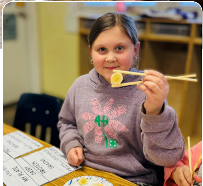
A student at New Salem Children's Center demonstrates her skills with chopsticks while eating banana sushi during a lesson about healthy foods.

Some programs were a special one-time activity for the students, but many programs contained multiple sessions, allowing Davis to better connect with students and reinforce learning. The 4-H Cloverbud programs demonstrated meaningful growth in participants over multiple sessions. At