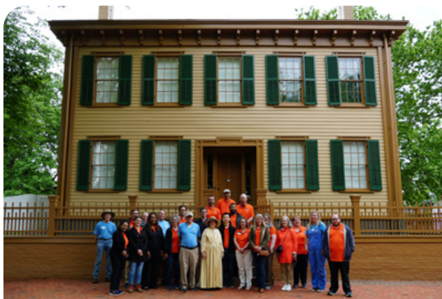
Master Gardener volunteers welcomed Extension Academy members to the Dean Home Heirloom Garden located at the Lincoln Home National Historic Site.

Local Master Gardener volunteers share their time, skills, and knowledge with the community through demonstration gardens. Each garden focuses on a different type of gardening, and the public is welcome to visit the gardens to look and learn. Along with gardens that showcase native plants, volunteers also care for gardens used for educational programs. The Children’s Garden at Henson Robinson Zoo is the site of hands-on educational activities during special events. The Dean Home Heirloom Garden located at the Lincoln Home National Historic Site includes examples of plants and gardening techniques that would have been familiar to Abraham Lincoln. The Herb Garden, Idea Garden, and Lorraine DeSouza Perennial Garden at the Illinois State Fairgrounds are the location of educational programs throughout the year and a connection to visitors from across the state during the Illinois State Fair.