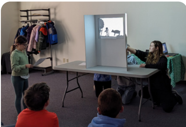
Youth expressed their creativity during Explore Arts and Cultures with 4-H day. They learned about Chinese shadow puppetry and then produced their own puppet plays by analyzing a story, making stick puppets, rehearsing, and performing. Other activities that day included Huichol yarn painting and a drum circle.

Other special activities held in 2024 included a Rabbit and Poultry Workshop, during which youth learned about caring for and showing animals; a Crime and Spy Funshop, during which attendees discovered clues to solve a crime; a 4-H Family Cooking Night, in which families join via Zoom from their home kitchens to cook a meal with live step-by-step instructions; and several programs held at local libraries.