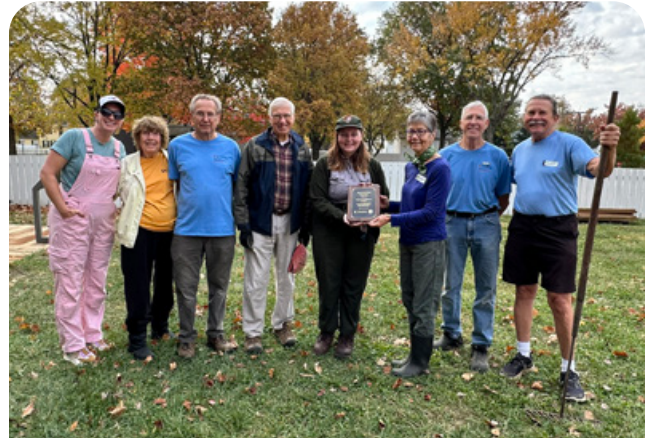
The volunteer team at the Dean Home Heirloom Garden received a State Master Gardener Teamwork Award.

Through a series of six classes, future beekeepers and those interested in understanding the process of creating honey gained insight into the fascinating world of honey bees. Topics included the life of the bee, common pests and diseases, bee equipment, how to inspect a hive, and care of the colony. This series is a partnership with Prairie State Beekeepers and the Sangamon County Farm Bureau. Forty-six learners participated in the classes, including eight youths. Attendees could join classes in person or via Zoom.