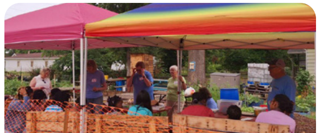
Master Gardeners shared information about growing vegetables during a session at the Motherland Gardens Community Project.