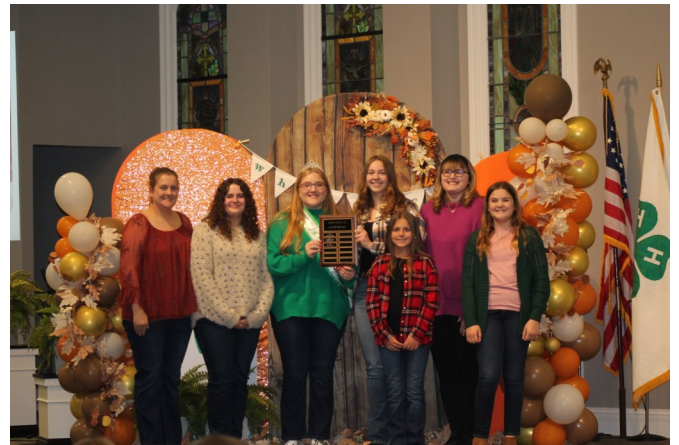
CLUB OF THE YEAR Mad Hatters 4-H Club