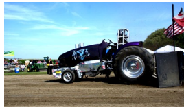
Truck & Tractor Pull Friday Night