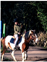
4-H Youth Horse Shows—Friday & Sunday