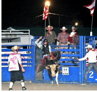
Rodeo - Thursday Night