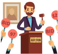
Friends of Extension & 4-H Auction Saturday evening