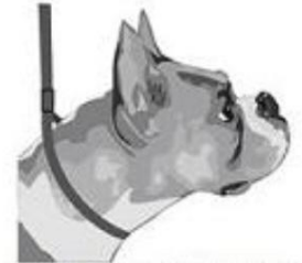
Lead place incorrectly on dog.