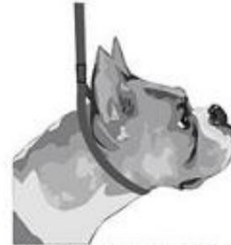
Lead placed correctly on dog.