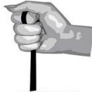
Lead held correctly.