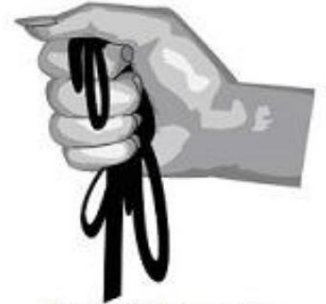
Lead held incorrectly.