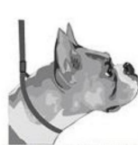
Lead place incorrectly on dog.