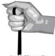
Lead held correctly.