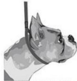
Lead placed correctly on dog.