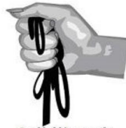
Lead held incorrectly.