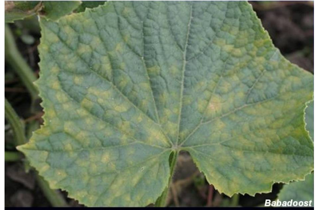
Figure 1. Downy mildew lesions on the upper surface of a cucumber leaf.

Symptoms on cucumber and squash are angular lesions that are limited by the leaf veins (Figure 1). On watermelon and cantaloupe, symptoms are typically irregular-shaped lesions on the foliage that turn brown rapidly. Infected leaves may experience an upward leaf curl. Symptoms on watermelon and cantaloupe are not as distinctive as on cucumber and squash and could be mistaken for other diseases such as anthracnose.