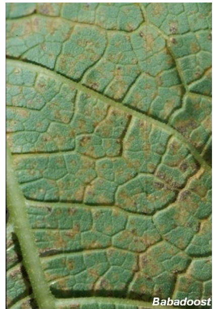
Figure 4. Downy mildew mold on the lower surface of a pumpkin leaf.

The pathogen produces large (20 - 40 x 14 - 25 mm in diameter), lemon-shaped sporangia (spores) (Figure 6). The sporangia are borne singly on the pointed tips of sporangiophores that branch at acute angles (Figures 6). Primary infections in the field or garden generally come from spores produced on southern grown crops and carried progressively northward on moist air currents during the spring and summer. The sporangia are disseminated locally from plant to plant and from field to field by splashing rains, moist air currents, insects, tools, farm equipment, the clothing of workers, and through the handling of infected plants. Heavy dews, fogs, frequent rains, and high humidity favor infection and rapid multiplication of the pathogen. Symptoms appear 4-12 days after infection. The pathogen favors cool and moist. Optimum conditions for sporulation are 59°F with 6-12 hours of moisture present (usually in the form of morning dew). Once infection occurs a new crop of sporangia are produced in 4 to 12 days, depending on temperature and day length.