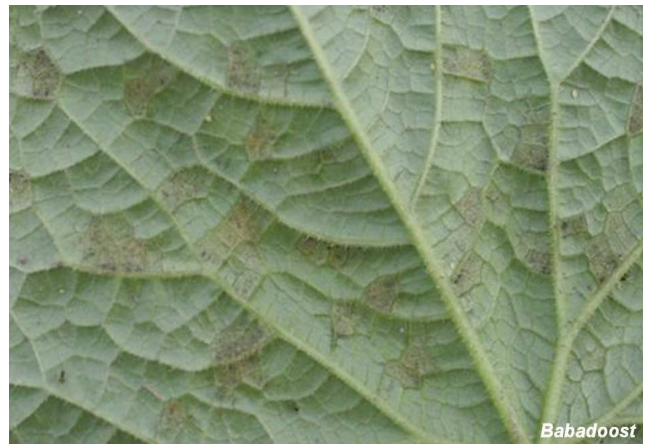
Figure 2. Downy mildew mold on the lower surface of a cucumber leaf.