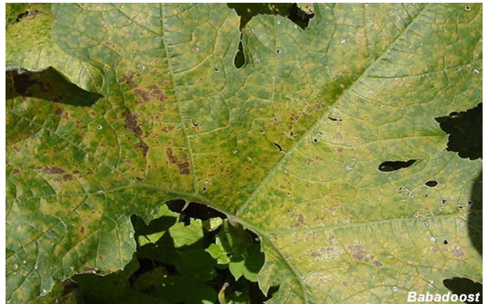
Figure 3. Downy mildew spots on the upper surface of a pumpkin leaf.

Pseudoperonospora cubensis is an obligate parasite, meaning that it requires live host tissue in order to survive and reproduce. Because of this feature, the pathogen must overwinter in an area that doesn't experience a hard frost (e.g., southern Florida) and wild or cultivated cucurbits are present.