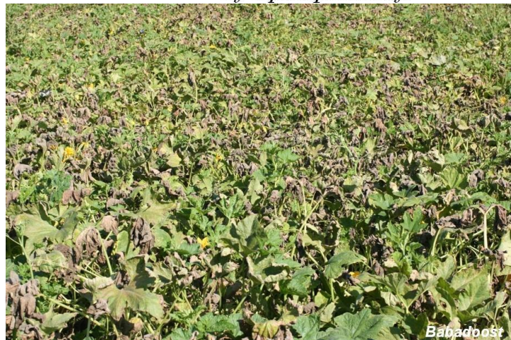
Figure 5. A pumpkin field with Pseudoperonospora cubensis -infected plants.

Five pathotypes have been described for P. cubensis . All described pathotypes infect susceptible cucumber and netted melon cultivars, but not all are compatible of infecting watermelon, squash, or pumpkin. This explains why cucumber and netted melons are sometimes heavily infected, while