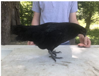
Luke Kilhafner: Poultry-Pullet