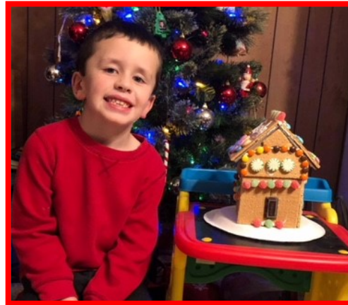
Crosby Schultz Winter Craft Day