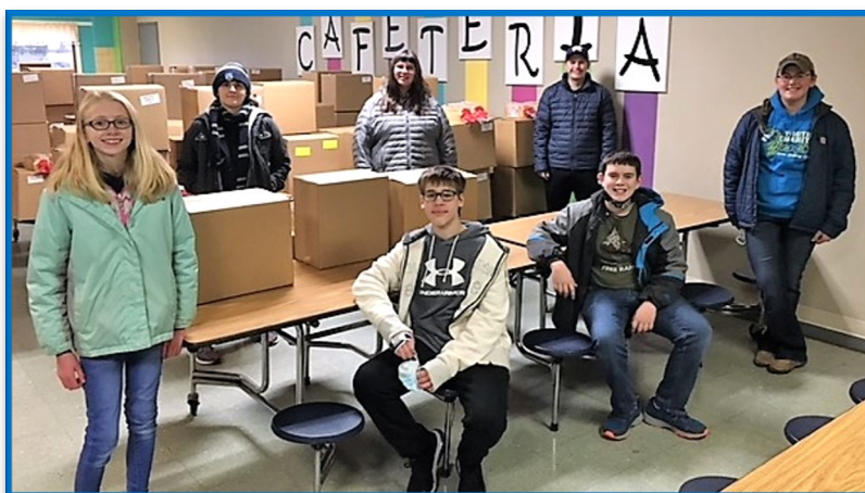
Federation helped with the December Windsor Food Mobile. This was the third month they participated. They unpacked nearly 300 boxes and served over 100 families. (face coverings were only removed for the picture)