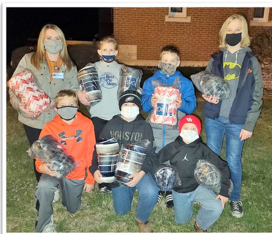
Oconee Eager Beavers donation of blankets