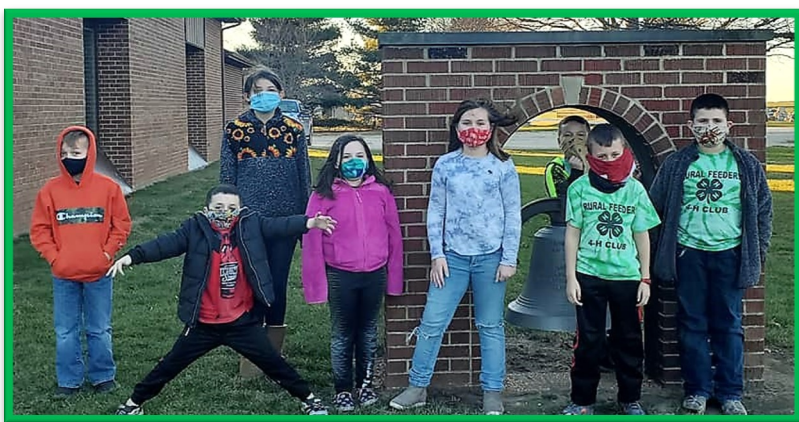
Rural Feeders packed and delivered food boxes to area residents.