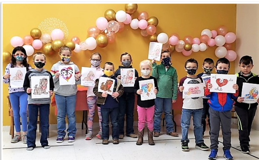
Shelby County Cloverbuds with their Valentine Coloring Sheets