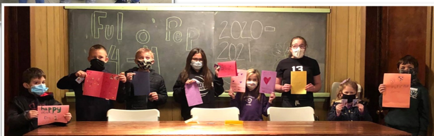
Ful-O-Pep Valentines Cards