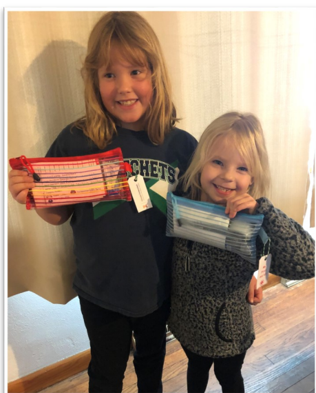
Explore 4-H First Aid Kits