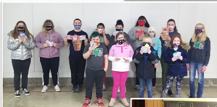
Shelby Showstoppers Valentines Cards