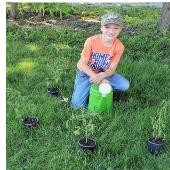
Cloverbud June Meeting