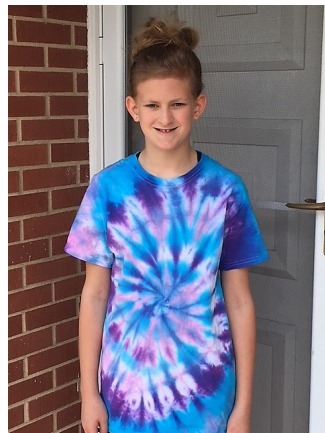
Tie Dye Fun!