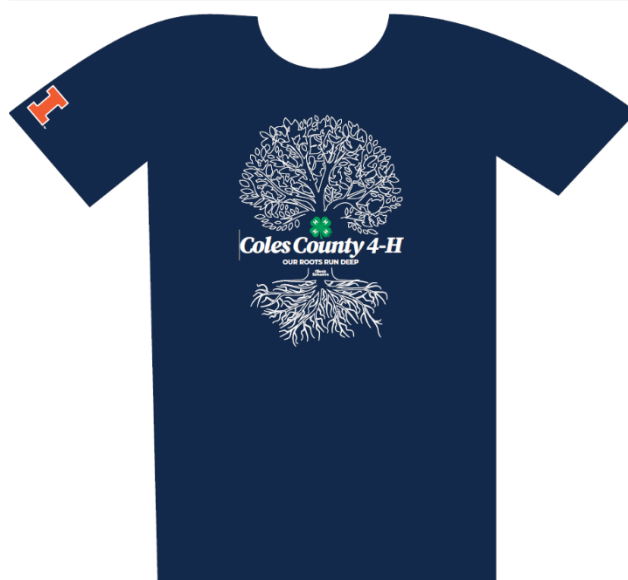
Tree with Roots

Order registration will close on June 6, 2022 .