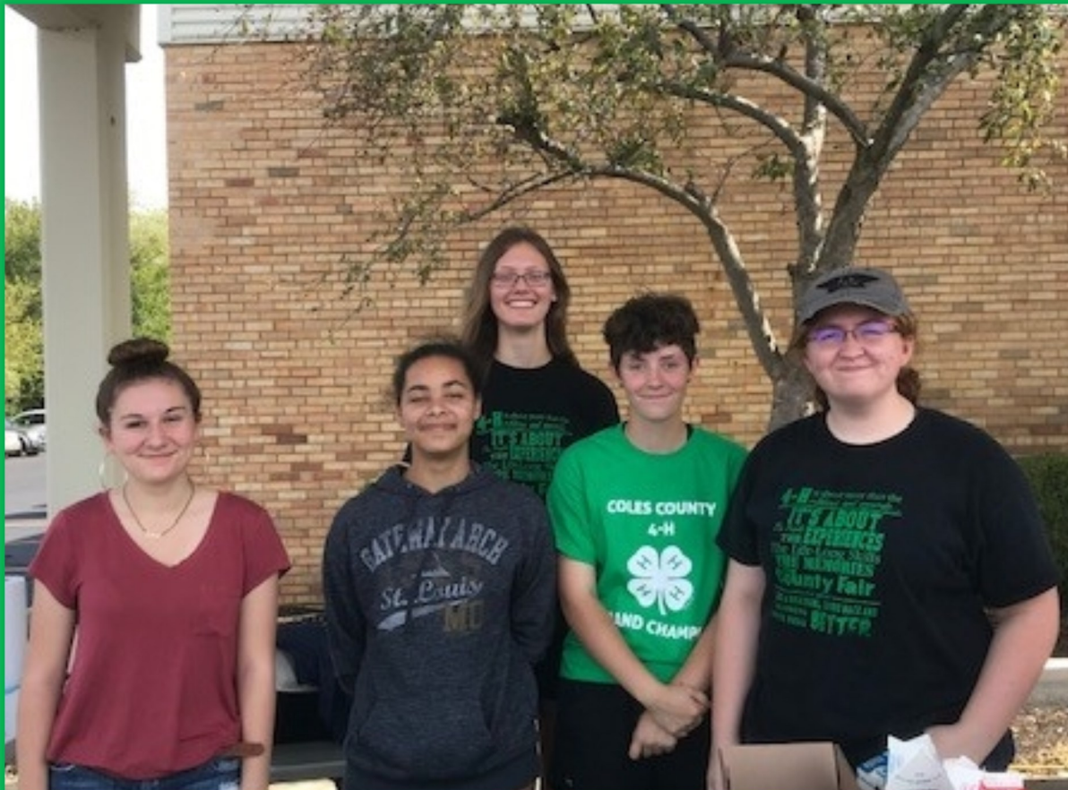
Federation members promote 4-H at the 18th Street Fall Festival