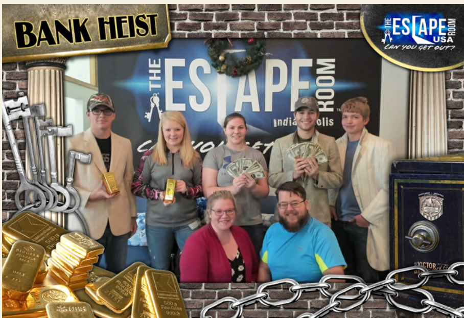
Federation members after completing their bank heist escape room.