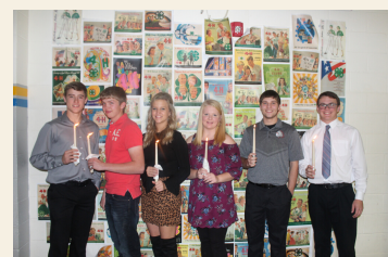
2019-20 Federation Officer Team

You don't inspire your teammates by showing them how amazing you are. You inspire them by showing them how amazing they are.