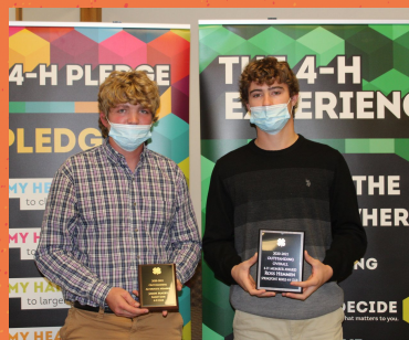
Cumberland County Alternate & Outstanding Overall Members