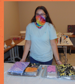
Moultrie-Douglas Paint Pouring Workshop

This fall we have participated in Douglas County Environmental Stewardship Day, Moultrie-Douglas Farm Safety Day and Arthur's Trunk or Treat. We have reached over 500 children from our involvement in these programs. We have also held our first paint pouring workshop and are prepping for the upcoming holiday craft workshop.