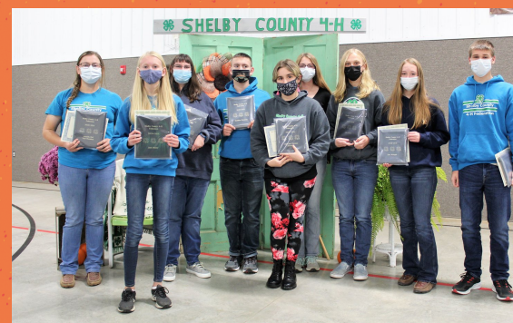
Shelby County 4-H Federation

Shelby County 4-H held its Achievement Night Program on Saturday, November 13. 140+ 4-H members and their families were in attendance to celebrate the many successes of the 2020-2021 4-H year. The program was led by a great group of Federation members. Awards included recognizing the 2020-2021 4-H Federation team, State 4-H Excel Award Medallions, Jr. Leaders, 4-H Experience awards, Outstanding 1st, 2nd, 5th and 10th year members, project award medals, outstanding secretary and treasurer awards, and leader recognition. Congratulations to all the winners; we are proud of your hard work and accomplishments. Pictures can be viewed on the Shelby County IL 4-H Facebook page.