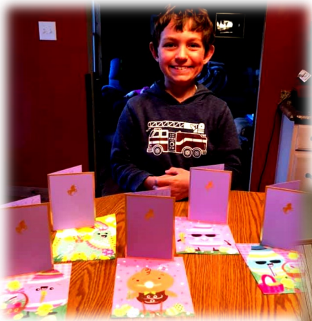
Ful-O-Pep members makes cards for the nursing home