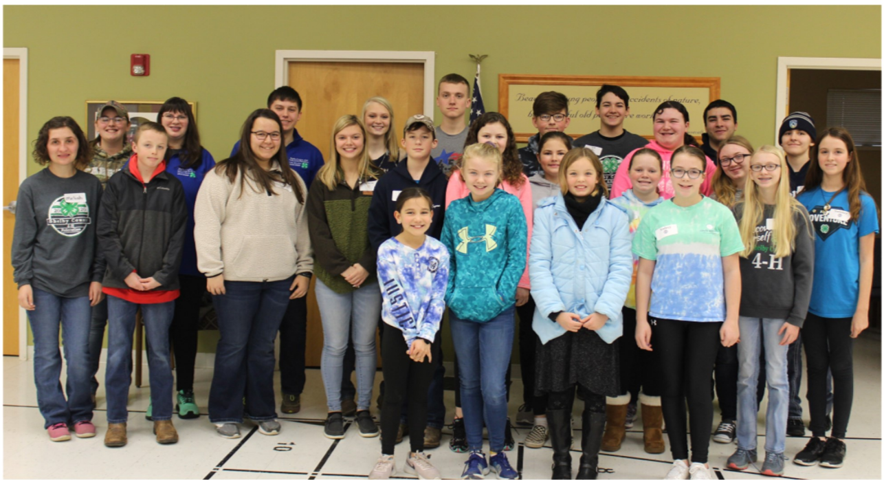
2020 Officer Training