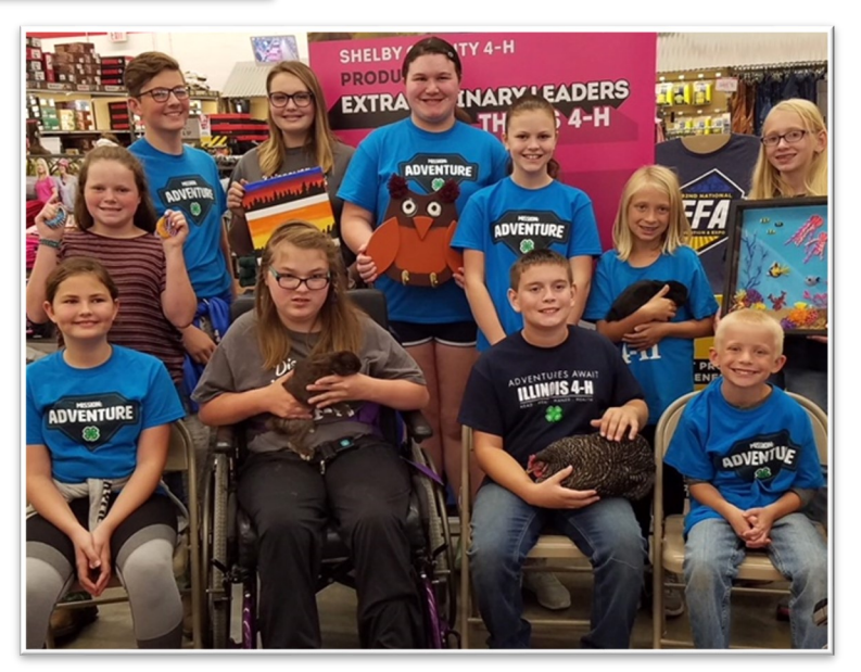
Showstoppers at TSC