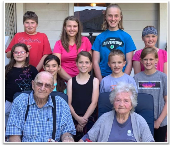
Oconee Eager Beavers Blankets for veterans