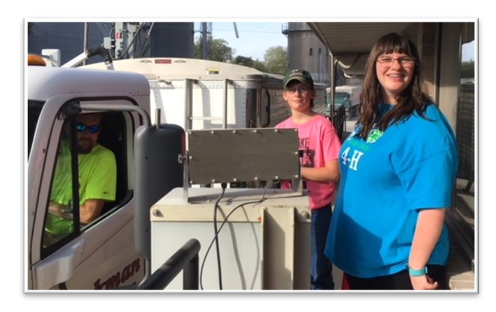
Harvest Bags delivered by Federation members