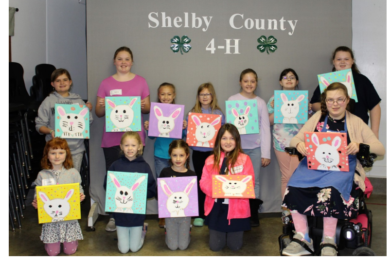
Bunny Canvas Painting