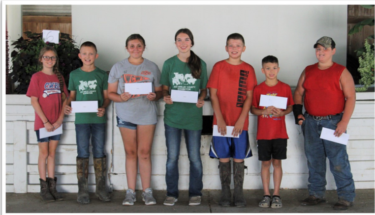
Clean Barn Winners