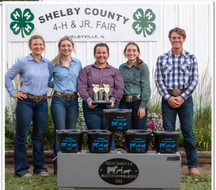
Master Showmanship Contest