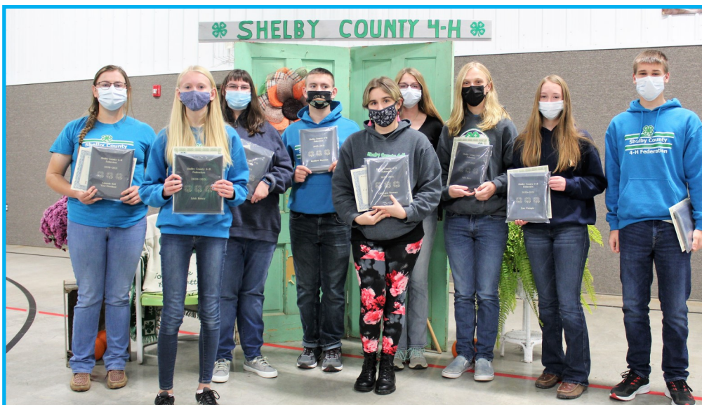
Federation Members Recognized